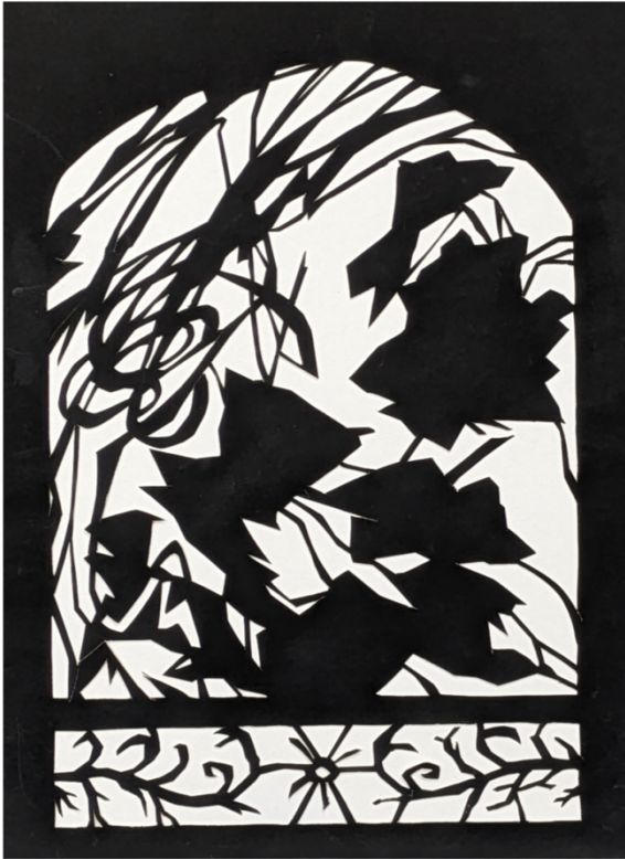
Deborah Ugoretz, "Pour Out Thy Wrath"